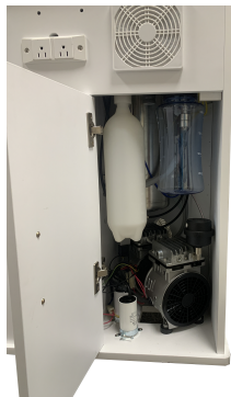
Rear compartment 4" W X 12"D X 20" H