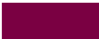
Desert Rose DU-06